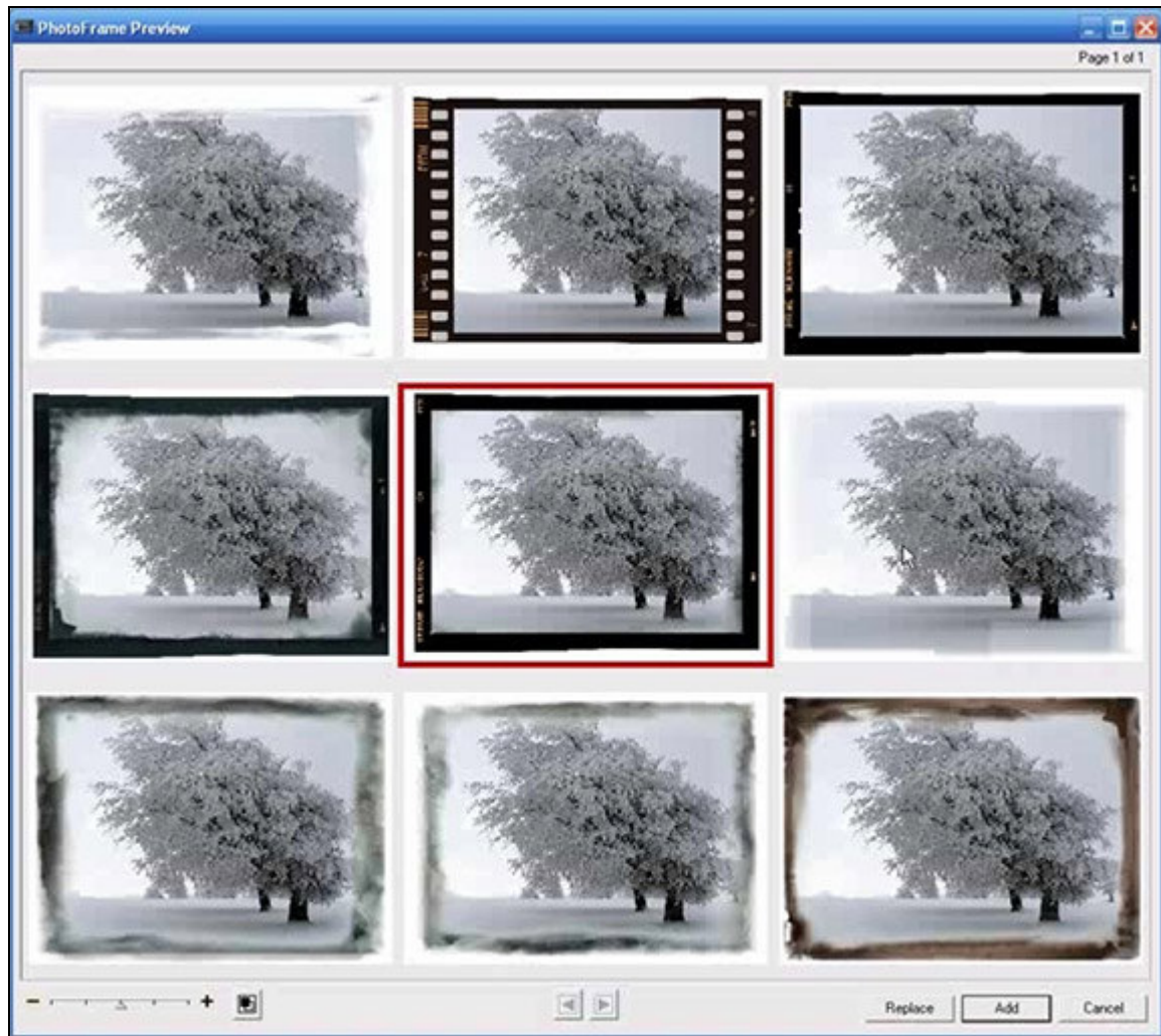
Frame Preview picture from PhotoFrame Pro 3 website tutorials

A great feature is the Frame Preview, which lets you select many frames or edge effects and view them on the same page. See picture below.