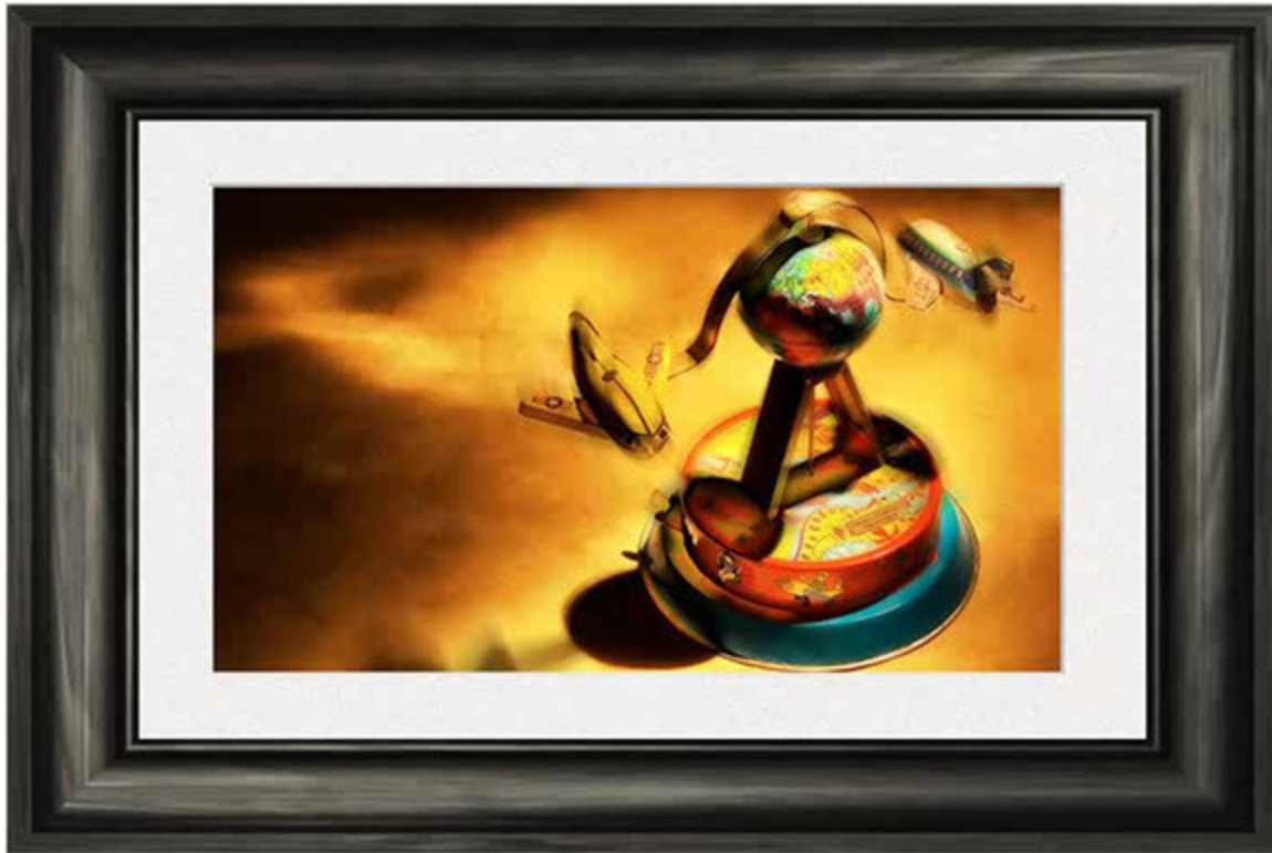
Photo from the PhotoFrame Pro 3 web site tutorials

Formal frames can have a cut-matte look, too. Although it is somewhat hard to see in this low res photo, the white matte in the screen shot below actually looks like a bevel-cut matte recessed in the frame!