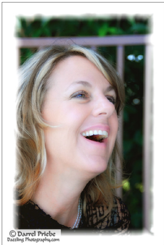
(IMAGE 5 – Model with Contrast Color Range, Glamour Glow, Reflector and Vignette filters)

I tried several more of the filters, and found many favorites, including these: