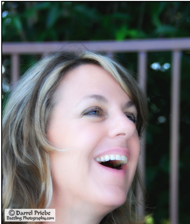
(IMAGE 4 – Model with Glamour Glow added to Contrast Color Range filter)

U-Point Technology is definitely the coming thing in digital darkroom tools. If you haven't tried it, you owe it to yourself to give this program a spin with the free 15-day trial.